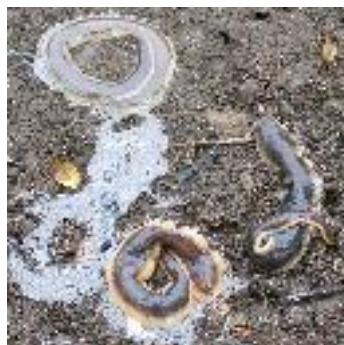
New Zealand Flatworm Arthurdendyus triangulatus .

The purplish-brown back combined with an oatmeal fringe and underside make them unmistakable. They may extend to 12cm, but often rest in a flat spiral. The larvae may be found in glossy black cases, about 7x5mm, like small blackcurrants.