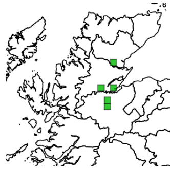
The distribution of records of the Shieldbug Fly in the HBRG database.

The first Highland records were in 2005, so we still know little about its status. It may have followed a potential host, the Hawthorn Shieldbug Acanthosoma haemorrhoidale , which seems to have spread north since the late 1990s. It might be expected anywhere in Highland where hosts occur.