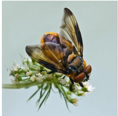
Shieldbug Fly Phasia hemiptera .

Unlike most Tachinid flies, Phasia is not particularly bristly, and can be passed over as a hoverfly. The male (pictured) is very easy to identify - squat, robust, large-eyed, and notably with broad, curved, dark-patterned wings. Females are rather less distinctive, though they have a conspicuous thorn-like ovipositor. Record only males unless confirmed by a specialist.