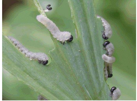
Solomon's Seal Sawfly.

This garden pest is best recognised by the defoliation of any Solomon's Seal plant it colonises. Adults are black and similar to many other sawflies, but the pale grey larvae, munching on the host plant until only midribs remain, leave no doubts.