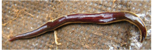
New Zealand Flatworm

A wooden board or plastic sack weighted with soil placed on bare ground will attract the worms. The purplish back, oatmeal fringe and underside make them unmistakable. They may extend to 12cm (5"), but when found under boards or bags they will usually be curled into a flat spiral. The larvae may be found in glossy black cases, about 7x5mm, like small blackcurrants.