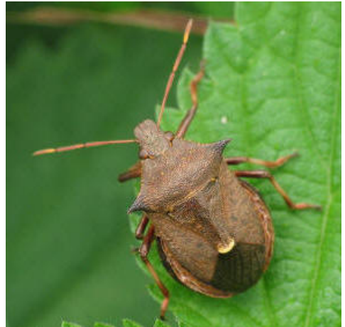
Spiked Shieldbug Picromerus bidens

This insect seems to have colonised and spread widely in Highland recently (blue <2006, green 2006 on).