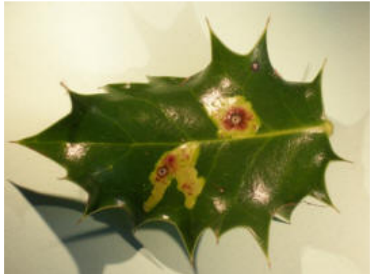
Holly Leaf Gall Fly Phytomyza ilicis .

The Holly Leaf Gall Fly Phytomyza ilicis is a tiny insect which develops inside the leaf of Holly, pupating inside the leaf and emerging in midsummer. It produces a characteristic blotch on the leaf - sometimes classed as a gall.