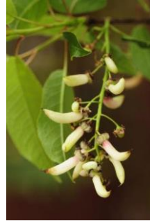
Taphrina padi galls.

This gall develops in the fruits of Bird Cherry Prunus padus . The normal black berry is distorted into a whitish, elongated, banana-shaped gall.