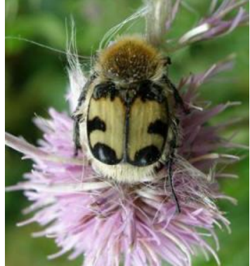
Bee-beetle Trichius fasciatus .

At 10mm or more long and strikingly marked, the Bee Beetle is easily spotted, although often the head is buried in the flowers and all that is visible are the unmistakable pale brown and black wing cases.