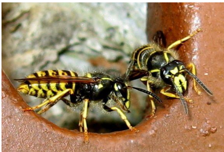
Saxon Wasp Dolichovespula saxonica ( source ).

HBRG has already produced atlases for bumblebees and ants. We are now planning a companion atlas for the social wasps. These are the ‘yellow-jacket’ wasps known (but not necessarily loved) by everyone.