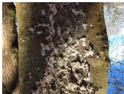
Beech Scale.

In heavy infestations it shows as fluffy white patches up to 1cm across on the trunks of old Beech. The 'fluff' is a waxy substance produced to protect the eggs and nymphs. Young colonies appear as thin lines of white dots, in narrow vertical fissures on the trunk. These can stand out as odd on the normally smooth Beech bark. A lens will reveal the insects in various life-stages.